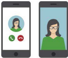
Live Telephonic Sessions